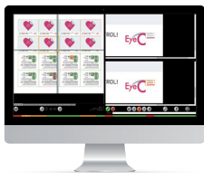
EyeC Profiler Content