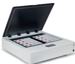
EyeC Profiler 400 - 600 DT