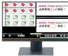
EyeC Profiler Graphic