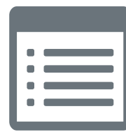
Audit Trail Viewer

By using our systems, you avoid product recalls, perform quick and automated quality controls, increase the security of your data and processes, and are well-prepared for audits.