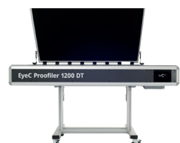
EyeC Profiler 1200 DT