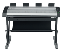
EyeC Profiler RS